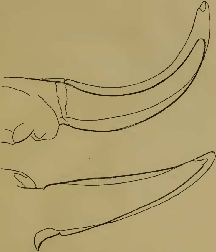
FIG. 2.—DIFFERENCES IN CURVATURE BETWEEN THE HORN CORES OF BISON CRASSICORNIS AND BISON ALLENI.

In this respect all specimens of B. antiquus differ very decidedly from any that have been referred to B. crassicornis , even such imperfect specimens as Richardson's type or the similar specimen figured herein on